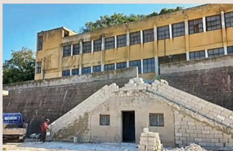
The school before rehabilitation