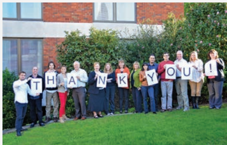
ADRA Australia staff photo, 2012

long-term development initiatives, therefore it changed its name to the Seventh-day Adventist World Service in 1973.