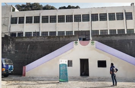
The school after rehabilitation

One example is of a school in rural Latakia. In October 2023, ADRA completed reconstruction of the school, benefiting 1,125 students. One student, Ilizabith*, 9, explains how the disaster affected students.