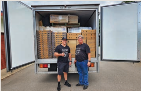
ADRA and church volunteers distribute hampers in response to Cyclone Jasper