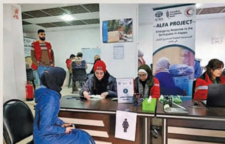
A woman registers to receive assistance in Aleppo

evolved from emergency aid to long-term rehabilitation, including the rehabilitation of school buildings and water systems.”