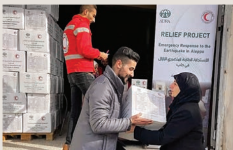
Relief packages distributed in Aleppo