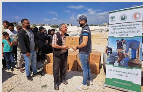
Families in Latakia receive food parcels