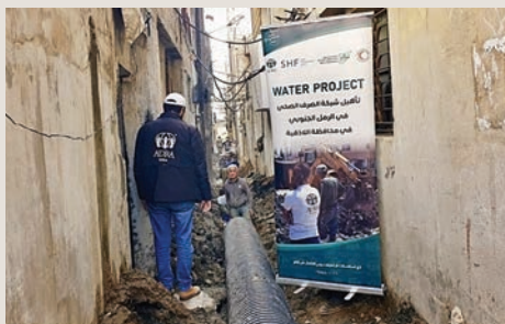
Repair of the water network